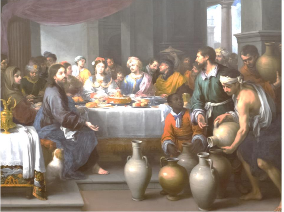
Wedding Feast at Cana