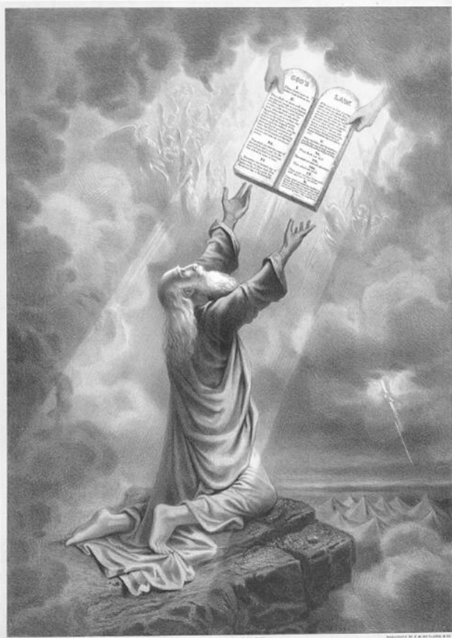
MOSES RECEIVING THE LAW.

BETHLEHEM EVANGELICAL LUTHERAN CHURCH 6409 N. 200 TH St. Altamont, IL 62411